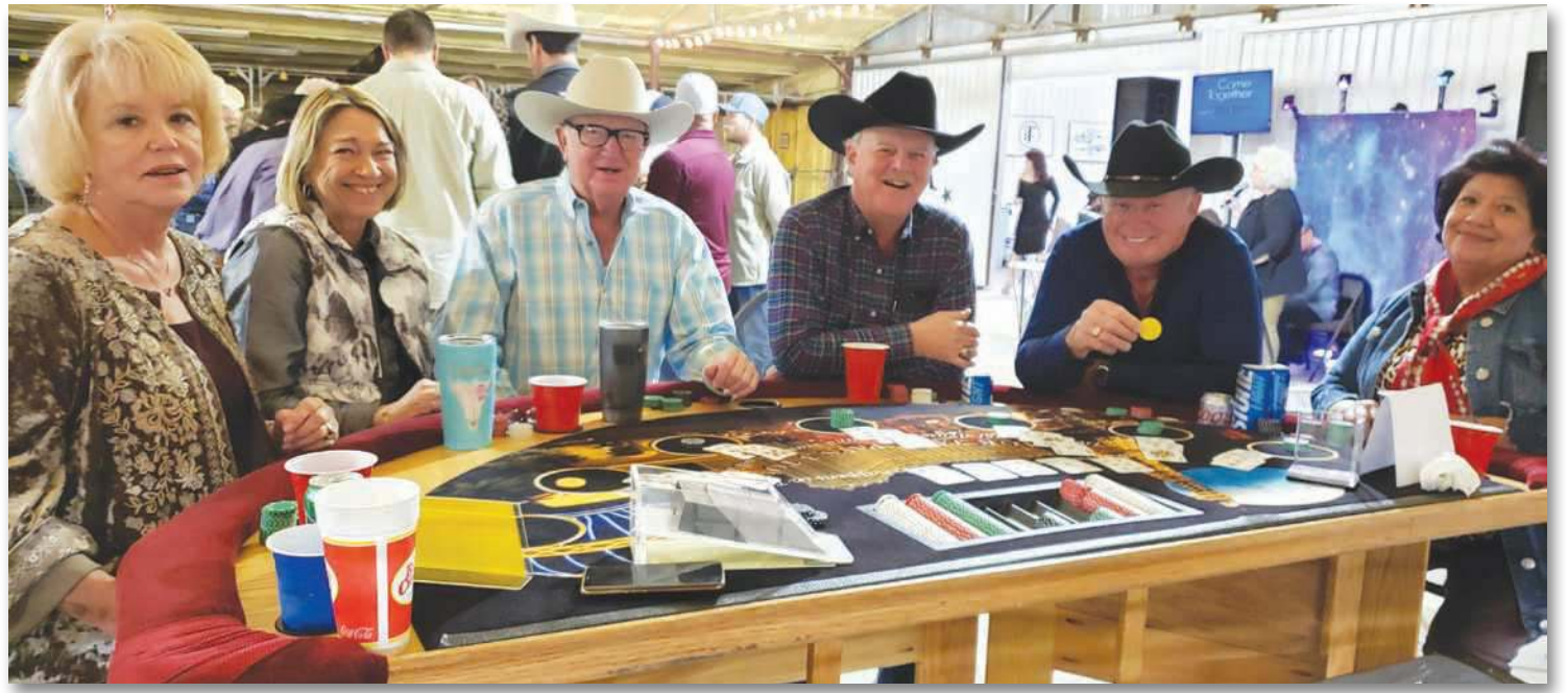
Participants enjoy festivities at the 2020 Wild West Casino Night hosted by Vision Lampasas. This year's event has been postponed.