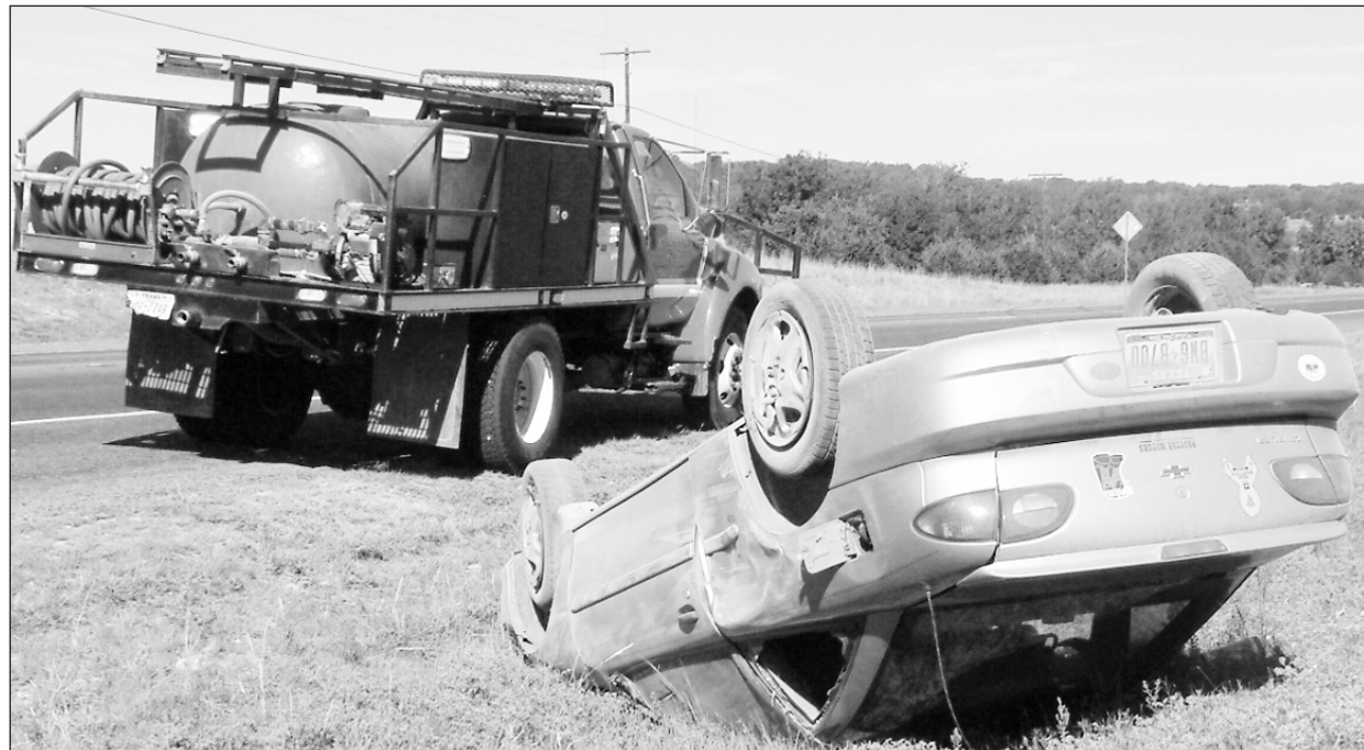
The driver of a southbound 2000 Chevy Cavalier drove off the right side of U.S. Highway 183/190 one mile north of town and overcorrected, which caused the car to roll over.

The fire department, sheriff's department, Lampasas Police Department and Capital Ambulance assisted at the accident site.